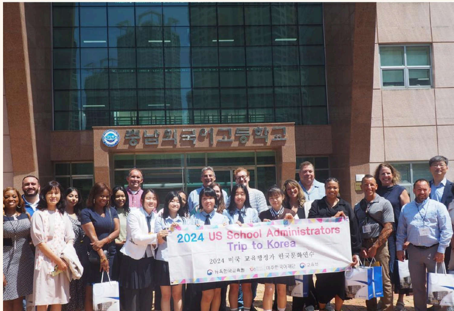
2024 U.S. School Administrators' Trip to Korea

A look at the kinds of collaborations our partner schools have run.